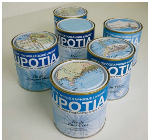
Fig. 2. Upotia: les îles de PACA , Nicolas Desplats. Mappamundi exposition, Hôtel des arts, Toulon, France, 2013.

In this artwork, irony is evident. Upotia represents the canned dream of a perfect cartography. It would allow the cartographer to fulfill his desire to draw the ideal border and to delimit space according to his will. Inside each bucket, we would find the promise of a new place, covering the imperfections of our reality and renewing our hopes for a better future. Another insight that could emerge from this artwork is that maps are seen as a kind of commercial product sold on shelves, a ready-made solution to reveal truths about our world. Thus, the impossibility of achieving utopia is revealed by the promise of a fake product that ensures miraculous effects.