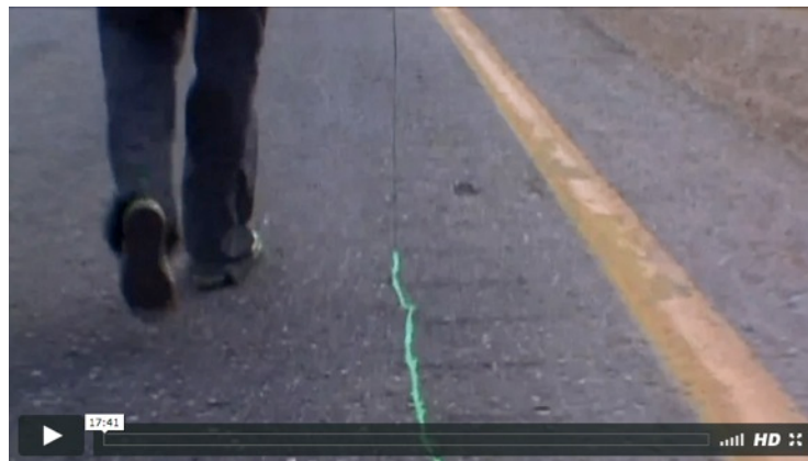
Fig. 4. The Green Line . Francis Alÿs. Jerusalem 2004.

The other artwork is called The Green Line and it refers to a demarcation created in 1949 due to an armistice agreement between Israel and its neighbors. The line was drawn by a military commander, using a green pencil on a map (Harmon & Clemans 2009), and it separated some disputed Palestinian territories in the West Bank. This demarcation had an extensive impact in local population. From both sides, their lives were affected by administrative, cultural, religious and security issues. Although that demarcation line was officially removed some decades later, its effects are still present. Since then, the line became a clear example of how an artificial decision on a map could impose power relations over a territory.